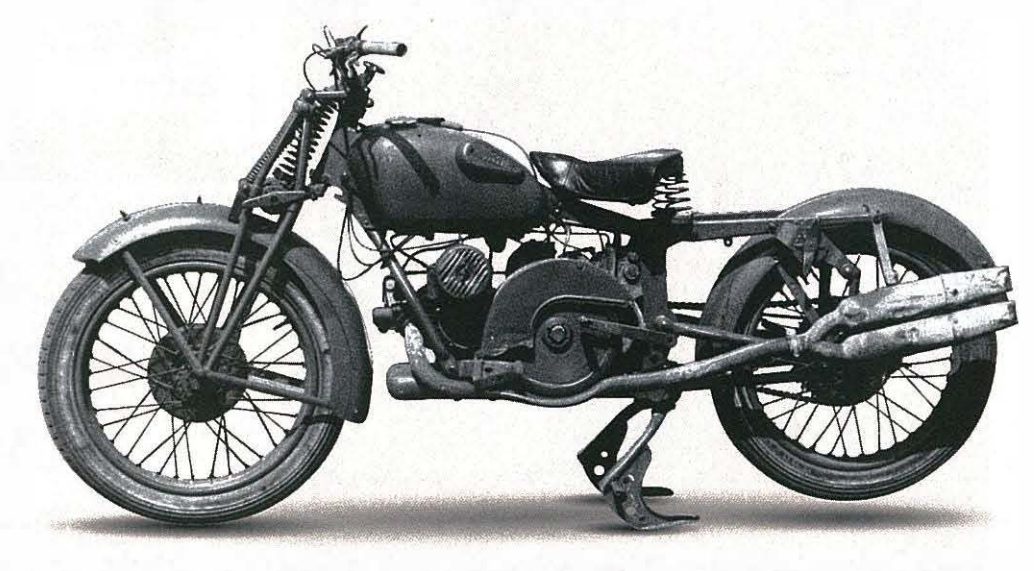
A 1945 picture of the 'Alce,' with the outside flywheel clearly in evidence.