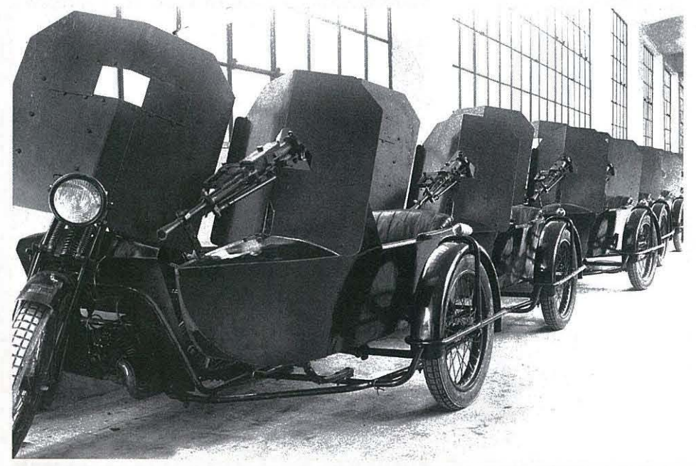
Moto Guzzi powered 'armoured cars,' apparently completed with the consent of Mussolini for use by the

These smaller Moto Guzzi V-twins were used by Dutch military (V-50, 490cc) and Yugoslav military (V-35, 347cc). Adapted from standard roadsters, they were offered with a number of military trim options but saw little service with the Italian military. Were offered along with bigger V-twins to authorities across the world however the larger 850/1000cc models usually gained the orders.